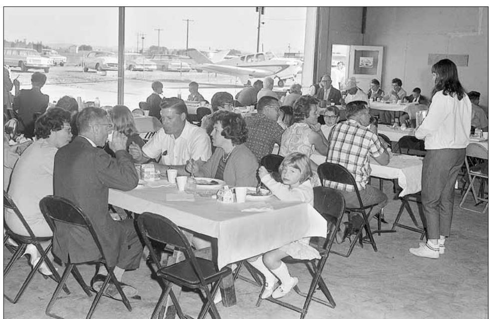
Above: (June 7, 1967) Some 350 people attended the Lions Club Fly-In Breakfast and Brunch held at the McMinnville airport Sunday. A special feature of the morning was a community worship service held in a hangar at which time Lions scholarships were presented.