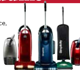
Several styles to choose from

Powerful cleaning performance, durability and ease of use.